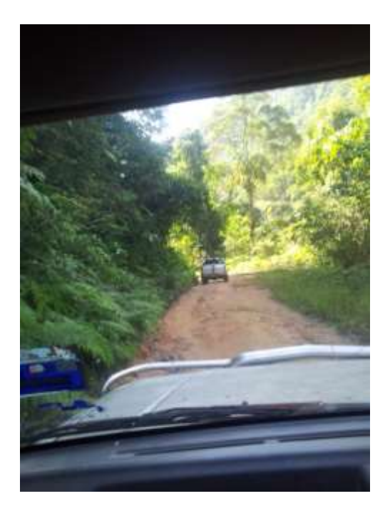
Figure 1: Journey to the main power intake

The above visit took place on 18<sup>th</sup> July 2016. Participants first gathered and then departed from IEM at 6:30am before eventually reaching Bentong at about 9:30am. Then, participants were transported to the Amcorp Sungai Perting Mini Hydropower station via four-wheel drive vehicles through jungle tracks as shown in Figure 1.