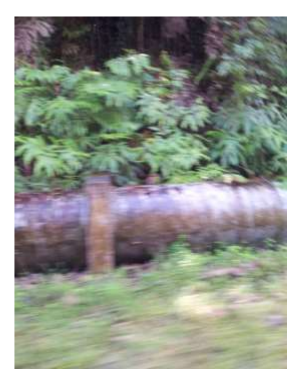
Figure 3: Pipe to transfer water to the powerhouse

As the pipe can only transports up to certain capacity of water, any excessive water will be flown back to the river.