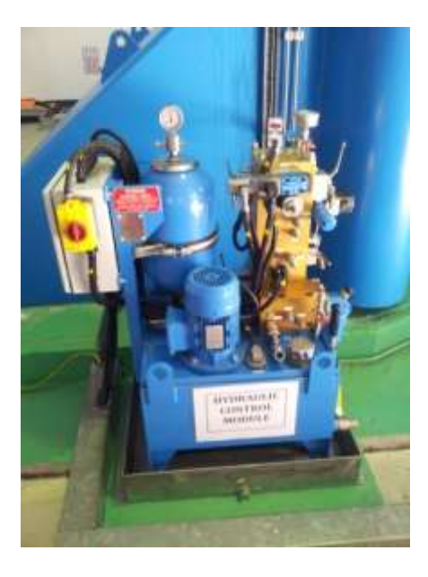
Figure 6: Hydraulic control module