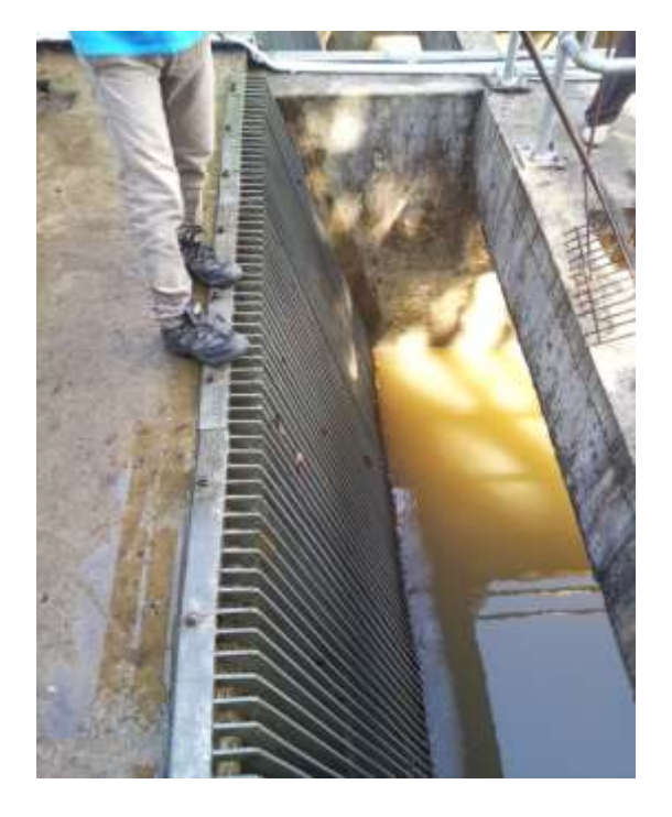
Figure 4: Trash rack for filtration purpose